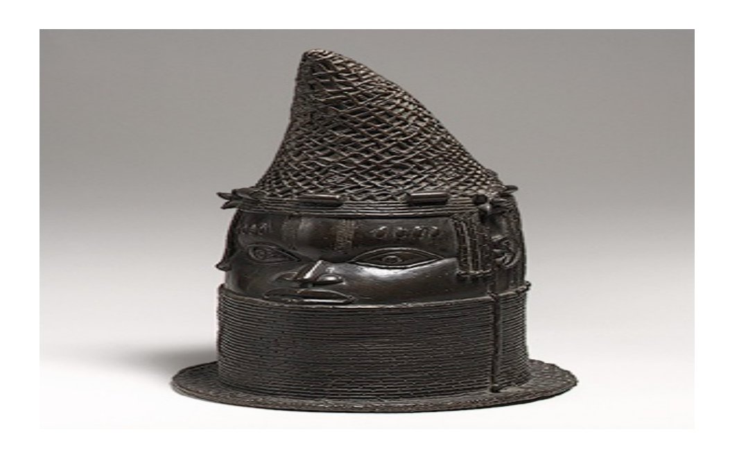
Head of a Queen Mother (Iyoba), 1750–1800