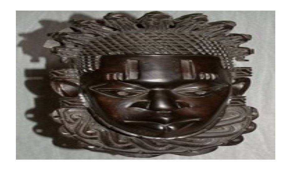
The Festac Mask - A modern day ebony wood carving of the Face of Queen Idia - mother of Oba Esigie

This was why the Mask was the symbol of the second Festival of Arts & Culture that was hosted by Nigeria in 1977, where all the people of African descent showcased their rich cultural heritage. Unfortunately, the original Mask, which is made of Ivory, is one of thousands of Masterpieces that was taken by Britain in 1897 in the so-called "Benin Massacre". It still remains in Britain today. However, for Nigerians and all black peoples, the Mask remains a veritable symbol of the resilience of the human spirit. It is the template on which the creative talent of the people married to their physical courage and vision for the future is based. (http://www.unesco.org/africa/ua/Background-FestacMask.pdf)