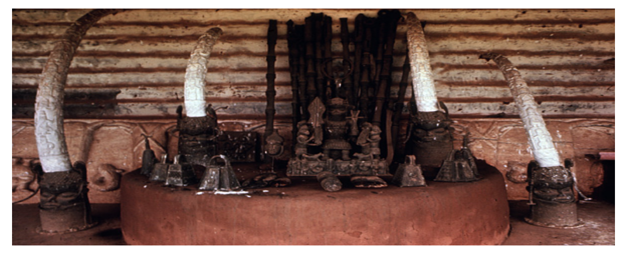
Benin Palace Ancestral Altar, dedicated to Oba Ovonramwen, Benin City, Nigeria photograph by Eliot Elisofon, 1970. Eliot Elisofon Photographic Archives

argue for an Indian origin in face of these two facts is only to waste time and serves no useful purpose. (51)