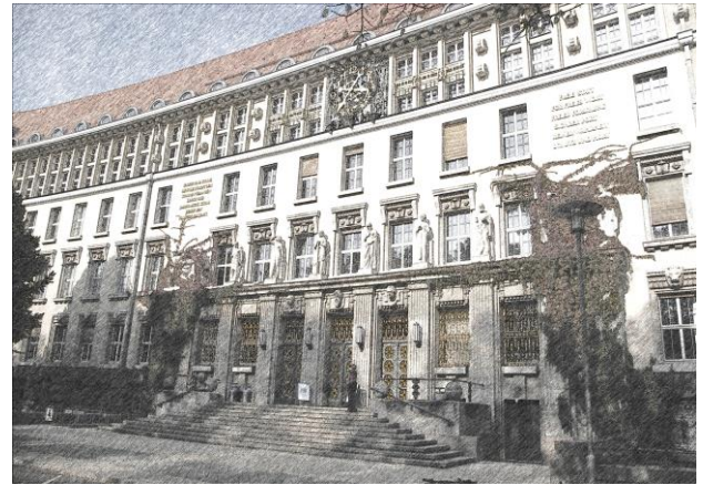
Figure-1C: The Deutsche Bücherei Leipzig

The Deutsche Bücherei Leipzig (Figure-1C) and the Deutsche Bibliothek Frankfurt am Main (Figure-1D) were united on the third of October, 1990 to establish the German National Library (Die Deutsche Bibliothek) which has become the national bibliographic archive of Germany.