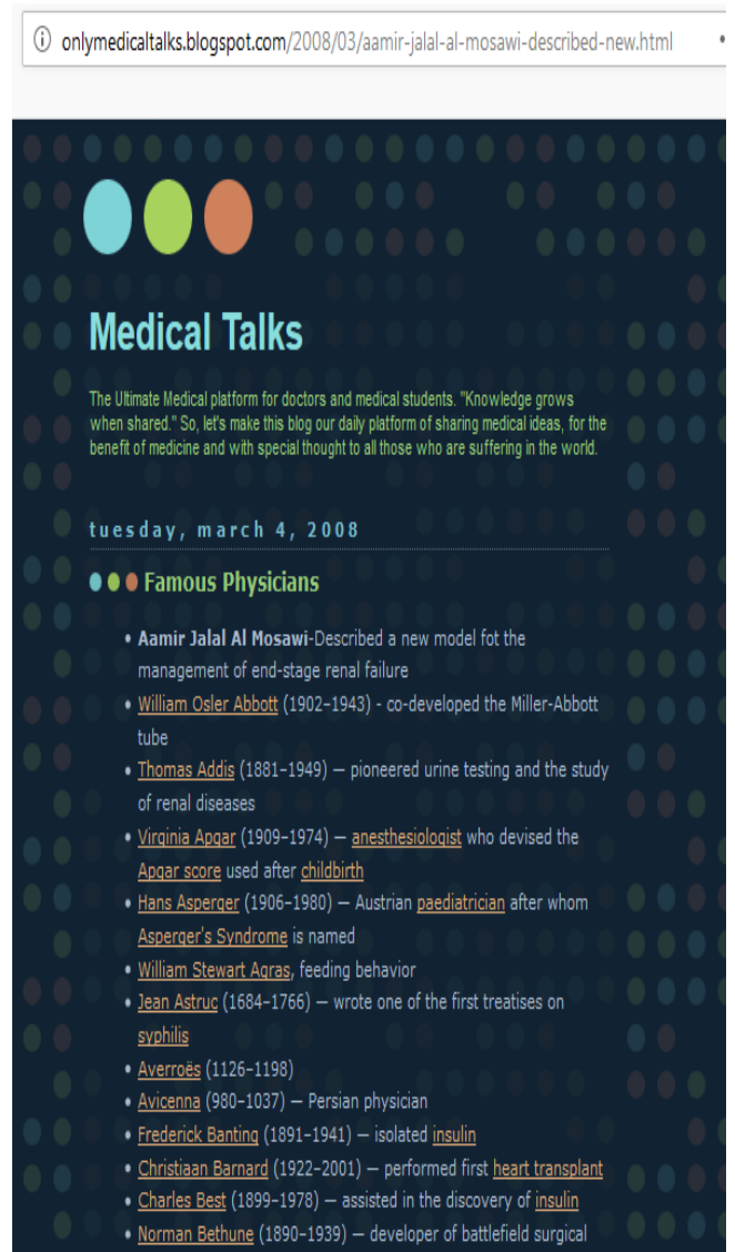
Figure-4: In 2008, the web site “Medical talks” listed Aamir Jalal Al-Mosawi with the famous physicians in history for describing a new model for the treatment of chronic renal failure

The study found a total of 53 papers published in a total of 11 journals including Pediatric Nephrology, Therapy (Clinical practice), Journal of Tropical Pediatrics, Journal of Nephrology and Renal Transplantation, Urology, Clin Exp Nephrol, American Journal of Medical Genetics A, The Open Urology & Nephrology Journal, and Acta Paediatrica, Archives of Disease in Childhood, and Saudi Journal of Kidney Disease and Transplantation. The vast majority of papers, 49 (92.4 %) were published by Aamir Jalal Al-Mosawi. Only four other papers [Etiological and clinical patterns of childhood urolithiasis in Iraq (2005), .Profile of renal diseases in Iraqi children: A single-center report. (2015) ,Hypertension in hemodialyzed children (2016), The predictive factors for relapses in children with steroid-sensitive nephrotic syndrome (2016)] were published by authors other than Aamir Jalal Al-Mosawi, and were carefully examined and found to include unreliable, non-authentic and largely misleading information [31].