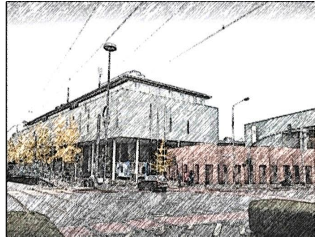
Figure-1D: The Deutsche Bibliothek Frankfurt am Main