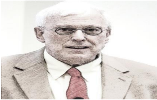
Figure-1B: Robert J. Sternberg, professor of Human Development at Cornell University